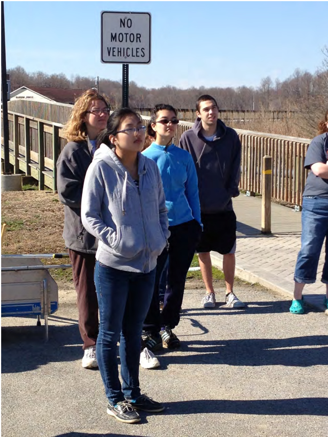
Students receive instructions for CB Railway Trail maintenance one Saturday morning in December, 2014.