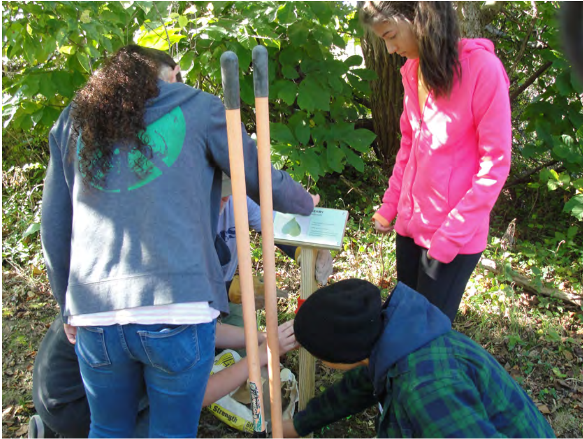
Installing flora signs in Bayview Hills, October 25, 2014.