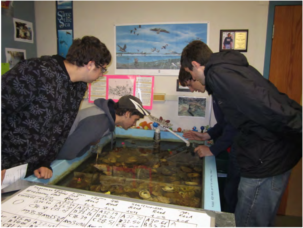
Members of the AP Environmental Science class exploring the estuarine research center.