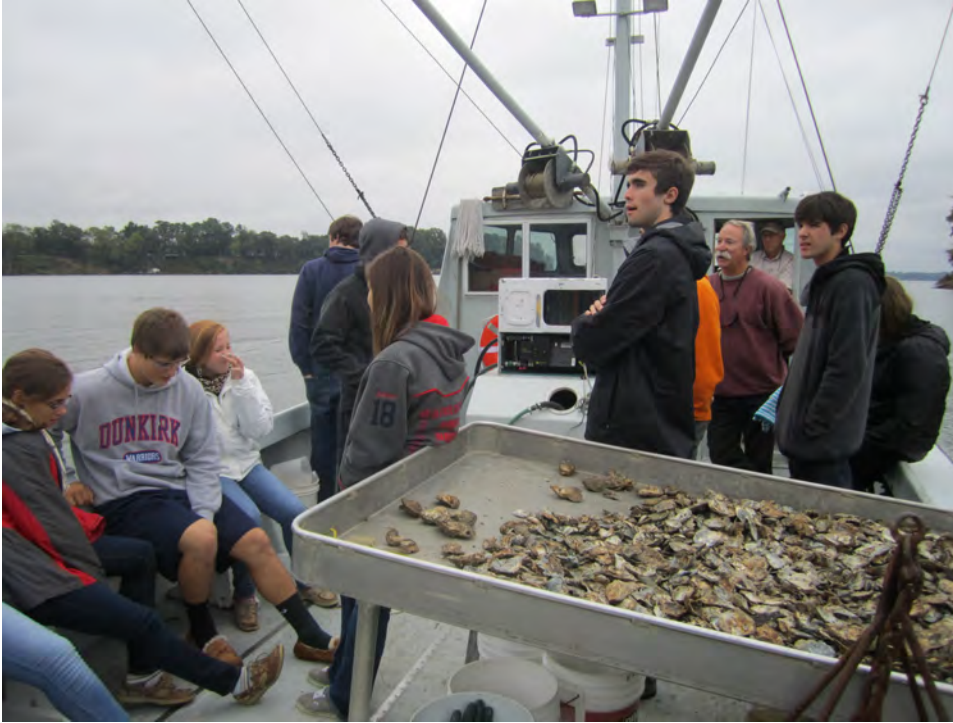
Students cull oysters and record water data while on the river, October 9, 2012.